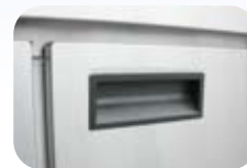
Integrated recessed door handle.