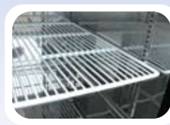
PVC coated wire shelf, economical but functional. SS wire shelf is optional.