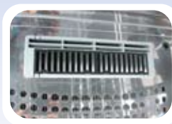
New air intake and outlet design, evenly deflecting cold air throughout the cabinet.