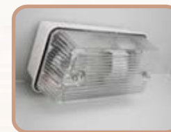
Detail : 1