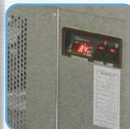
Detail : 1