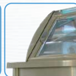
Detail : 2