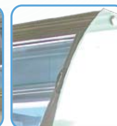
Detail : 3