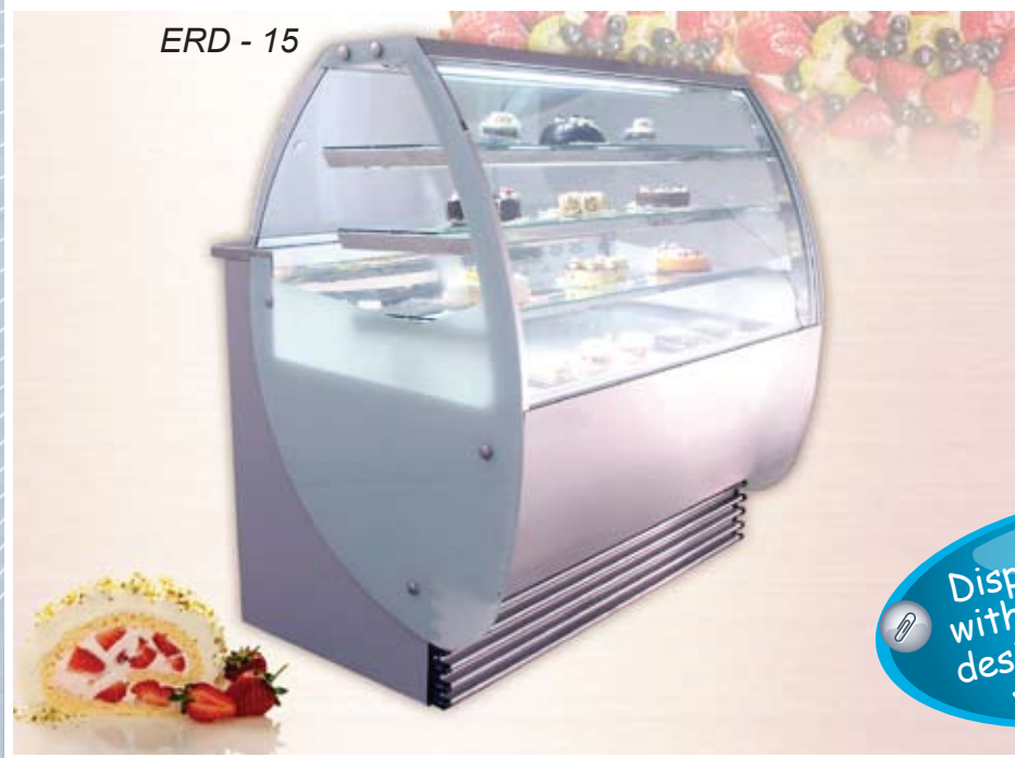
ERD - 15