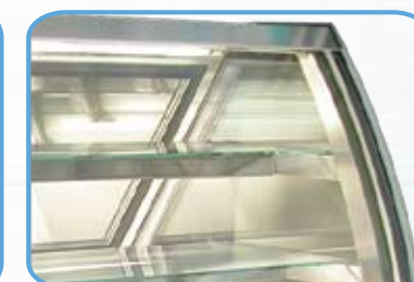
Detail : 4

Display showcase with contemporary design to highlight your product.