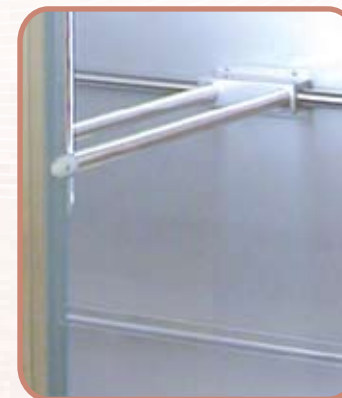
Detail : 1