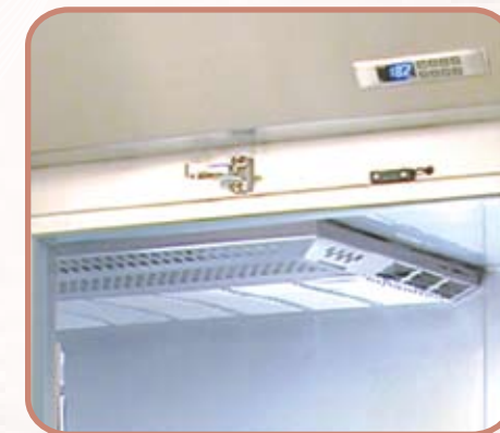
Detail : 2