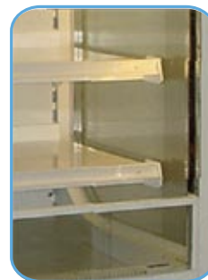
Detail : 3