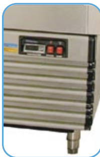
Detail : 1